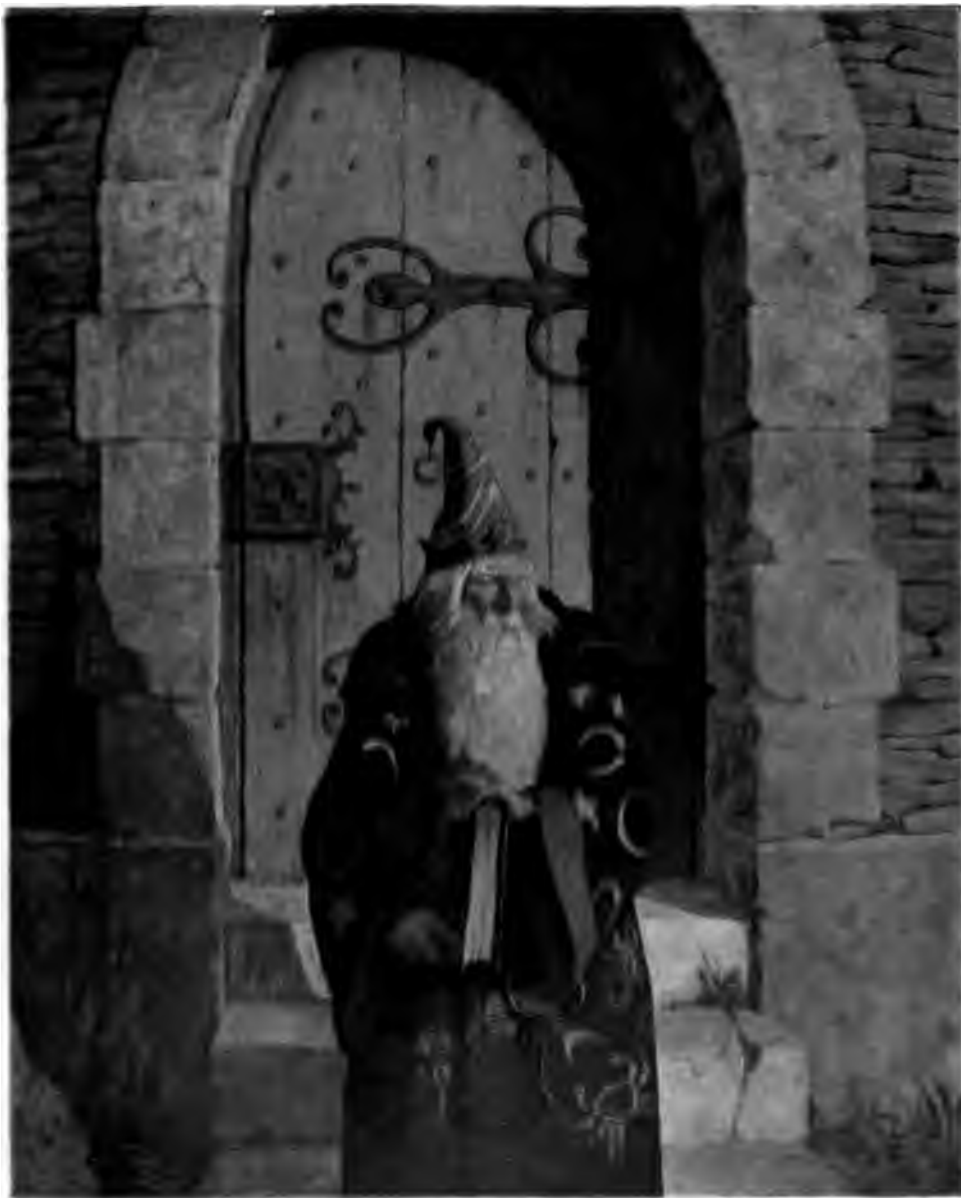
ON THE FOURTH DAY COMES THE ASTROLOGER FROM HIS CRUMBLING OLD TOWER